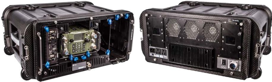
Figure 1 Voyager 158 Front and Rear